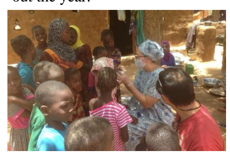
(Continued on page 2)

ADI is thankful for caring staff and qualified support personnel who offer timely assistance to people experiencing mouth pain. During one busy week, an American dentist and nurse performed 250 tooth extractions. Our center is also open to clean teeth and assist patients throughout the year.