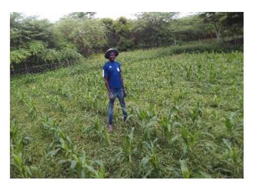
One of our interns standing amidst the growing corn.