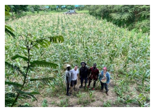
ADI partners and interns in the corn field they planted.